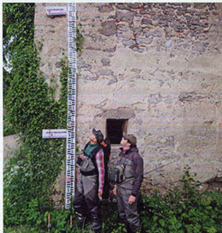
"Please tell me we're not expecting a spate..."