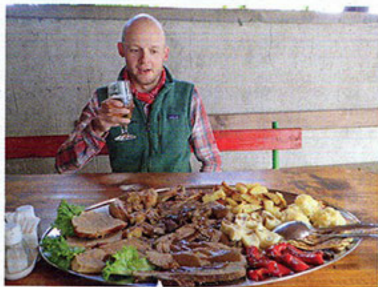
The après-fish is none too shabby, either...