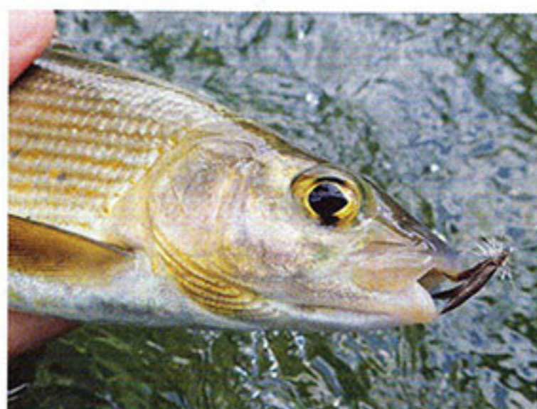
Unica grayling think nothing of rising 6ft for a dry.