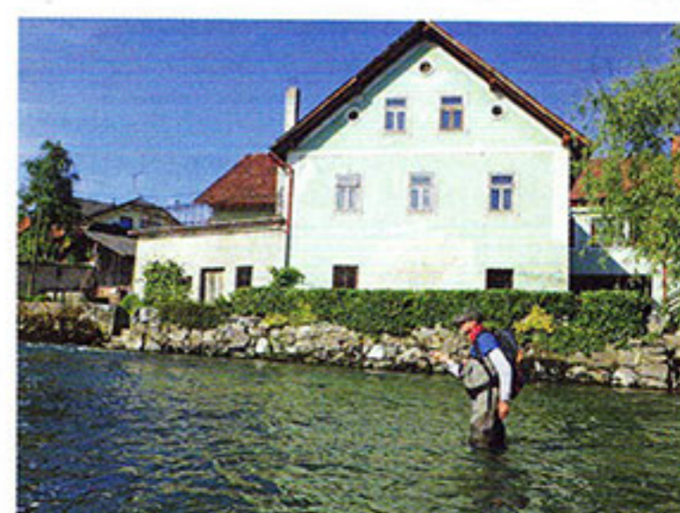
Urban fishing, Slovenian style, on the Krka.