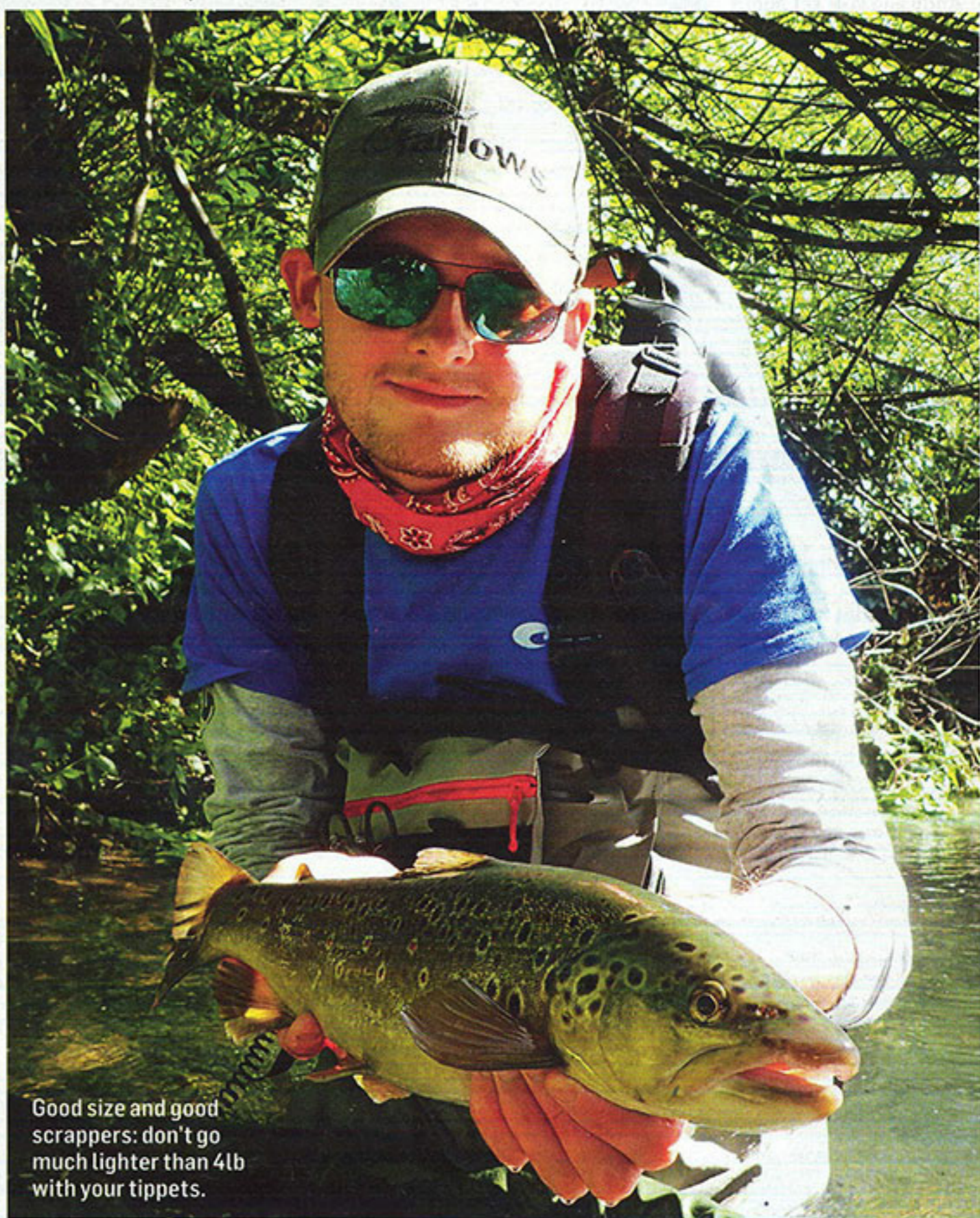
Good size and good scrappers: don't go much lighter than 4lb with your tippets.