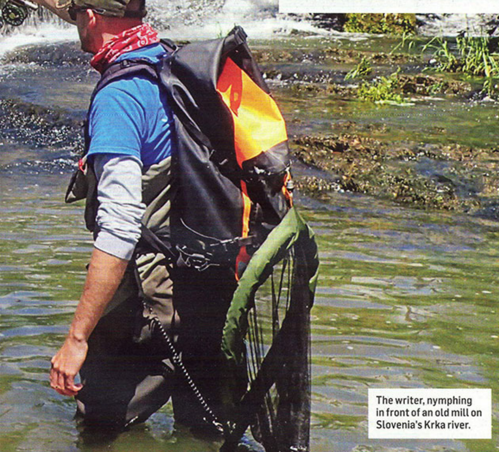
The writer, nymphing in front of an old mill on Slovenia's Krka river.

W HAT comes to mind when you think of Slovenia? Marble trout or wild rainbows in blue alpine streams, surrounded by forested mountains, maybe? World-renowned rivers such as the Soca, Idrijca, or Sava Bohinjka?